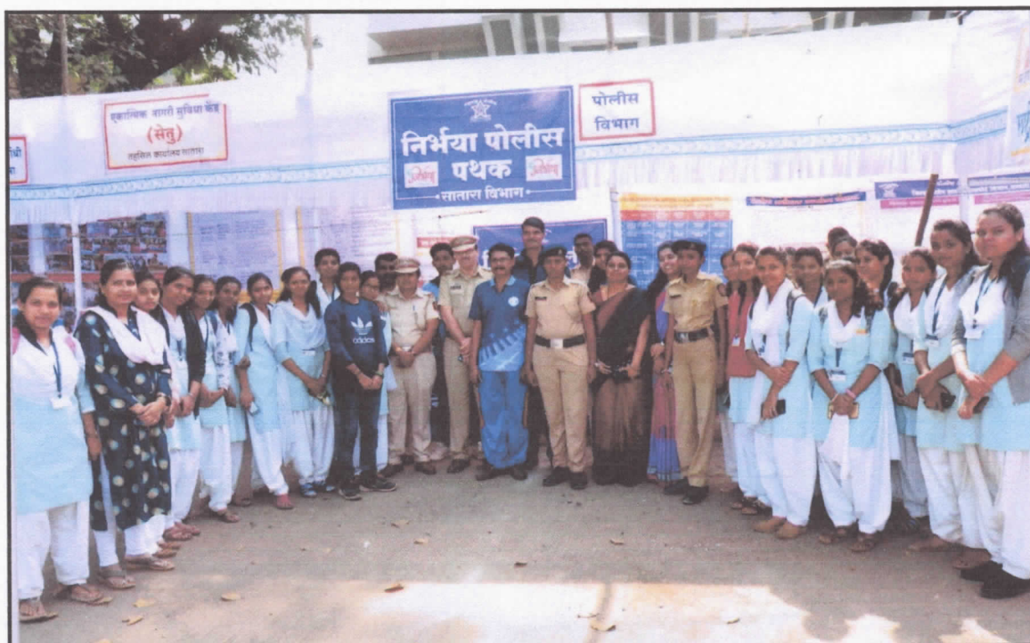
(Practical Training on Self Defense dated 24 Dec 2019)