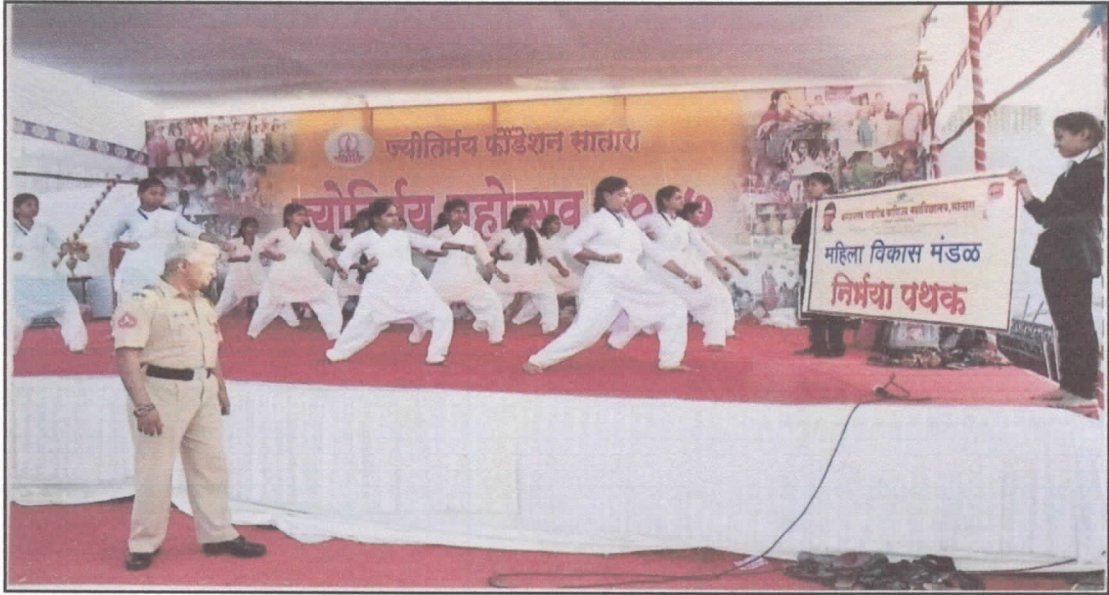
(Karate Presentation at Jyotirmai Exhibition dated 11 Dec 2017)